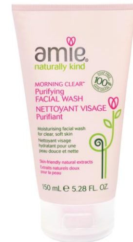
AM2505C MORNING CLEAR FACIAL WASH An exceptional soap-free facial wash, pH balanced with a 15% moisturising formula leaves skin beautifully cleansed and deeply refreshed SIZE: 150ML UOM: 6