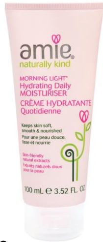
AM4501C MORNING LIGHT DAILY MOISTURISER A light hydrating moisturiser, keeps skin soft, smooth & nourished. Rich in rose extract, rose hip oil and mallow SIZE: 100ML UOM: 6