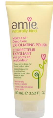
AM6500C NEW LEAF DEEP PORE EXFOLIATING POLISH A refreshing deep-cleansing treatment that works pore deep to draw out dirt and impurities SIZE: 100ML UOM: 6