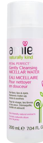
AM6501C PETAL PERFECT GENTLY CLEANSING MICELLAR WATER Effective all-in-one cleanser, toner and make-up remover suitable for all skin types. Rose petal and argan extracts ensure skin is left beautifully refreshed, toned and soft. SIZE: 200ML UOM: 6