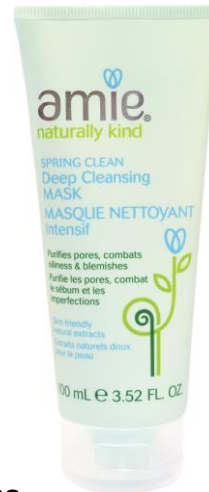
AM3523C SPRING CLEAN DEEP CLEANSING MASK A refreshing deep-cleansing treatment that works pore deep to draw out dirt and impurities SIZE: 100ML UOM: 6