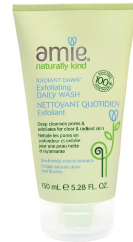
AM2501C RADIANT DAWN DAILY WASH Exfoliating daily wash for deep cleansing. Contains Green Apple, Lemon Extract, Blueberry Seed and Vitamin E bursting beads SIZE: 150ML UOM: 6