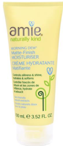
AM2507C MORNING DEW MOISTURISER A light daily mattifying moisturiser, leaves skin hydrated & oiliness controlled. Contains Rosehip and Bilberry SIZE: 100ML UOM: 6